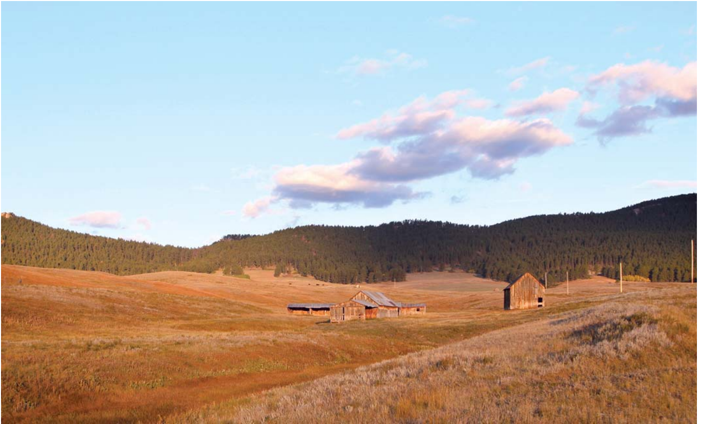
Reynolds Prairie is one of three large meadows in the Black Hills. The others are Slate Prairie and Gillette Prairie. Gillette, like Reynolds, remains an open grassland, but some development has occurred at Slate, below Harney Peak.

the native people. “This is one of five sacred places on the Lakotas’ annual journey, which entails the track of the path of the sun through the heavens,” he says.